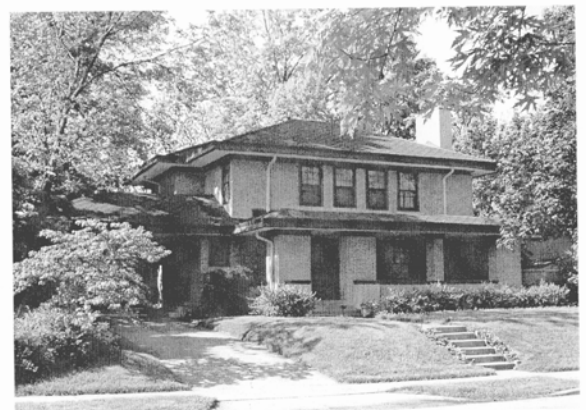
The William Blistain House Designed in 1914

The Resource Guide is available in the Trust Office for $15.00