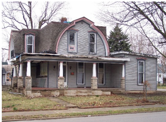
206 Railroad Street Battle Ground