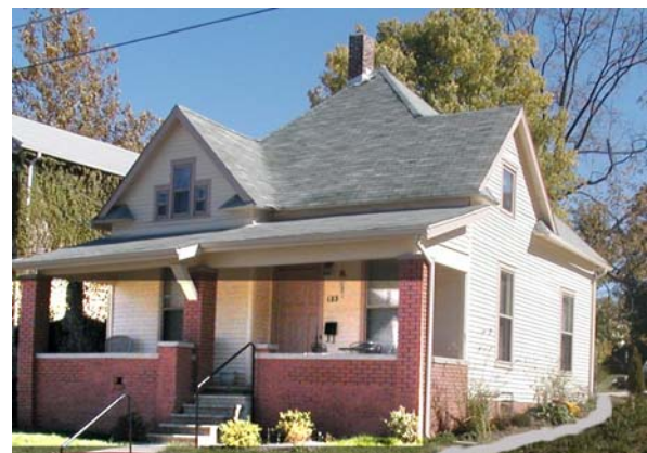
123 S. 7th Street Lafayette In -A Restored Home-

Wabash Valley Trust is a Community Housing Development Organization with the City of Lafayette. Through the HOME Funds Program, the Trust acquires houses in historic and established neighborhoods to restore. The houses are sold to qualified low to moderate income buyers. This program saves structures, revitalizes the neighborhoods, and enhances the cultural heritage of the Wabash Valley area. Currently the Trust has a partnership with a local contractor to restore the house at 206 Railroad Street in Battle Ground and is working to purchase two additional houses to restore and sell by the end of the year.